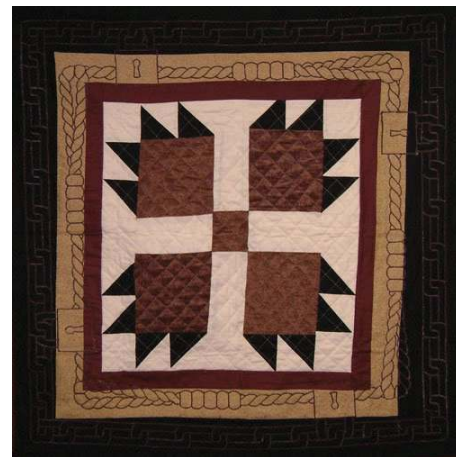
Bear Paw code instructed runaway slaves to follow the bear tracks through the mountains, staying away from roads.