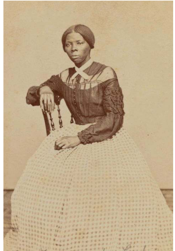
Harriet Tubman wearing a shawl given to her by Queen Victoria, ca. 1897.

Turning her attention to women's suffrage, she continued fighting for everyone who suffered inequality.